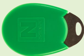
KCP4000 proximity keyfob for residents

BATICONNECT CLOUD 24/7/365 Programming at any time from anywhere www.baticonnect.com