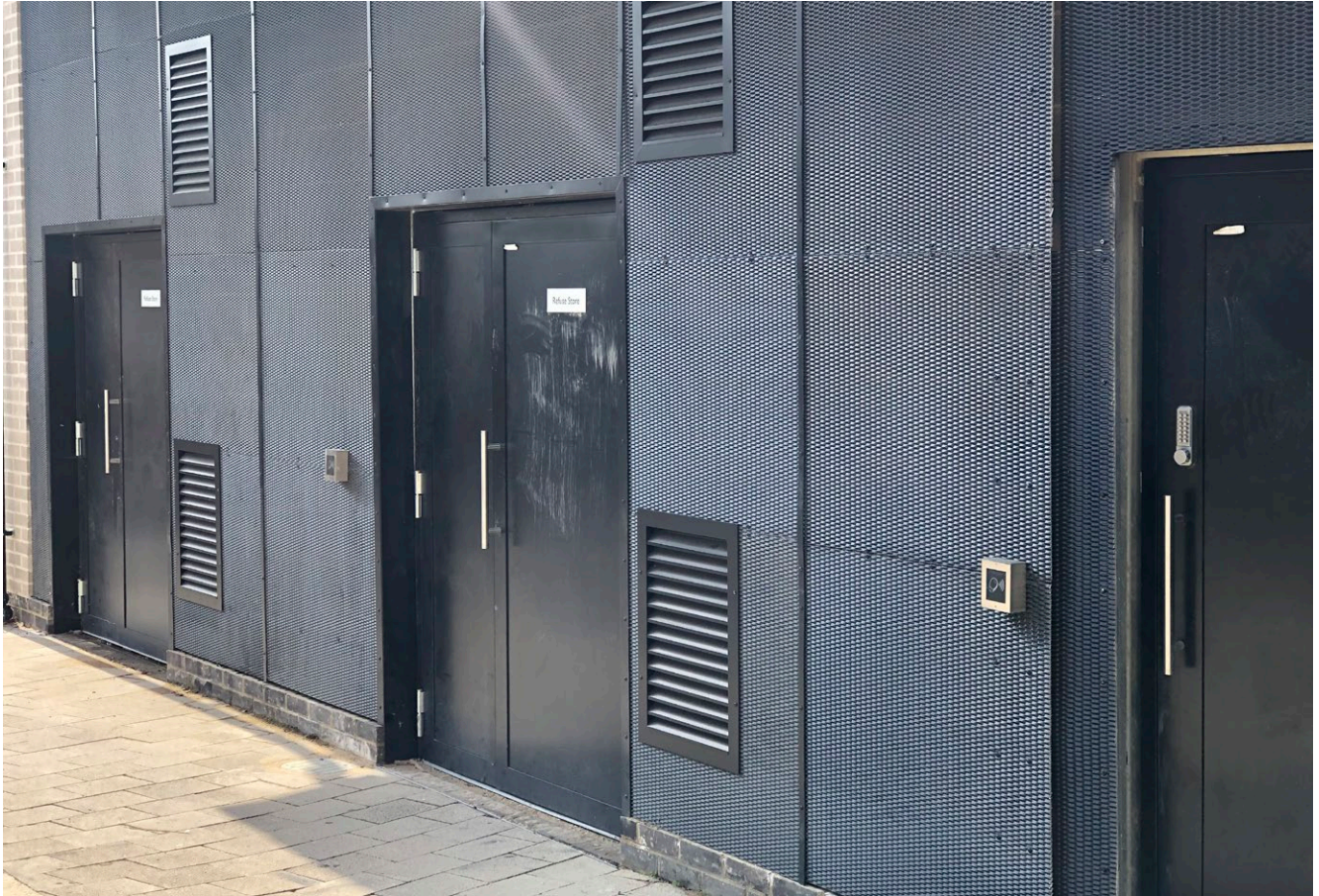
All external bin and bike stores are proximity controlled.

The Machine Works House development (Old Vinyl Factory) consists of 81 flats. In addition to the 2no post mounted IPVIEW® panels with integral proximity access control on the main ground floor entrances, the fully remotely managed BATICONNECT® CLOUD access control system has a further seven IPVIEW® panels internally plus 22 secondary proximity reader controlled doors and pedestrian gates.