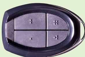
TEL433 coded radio transmitter for motorists