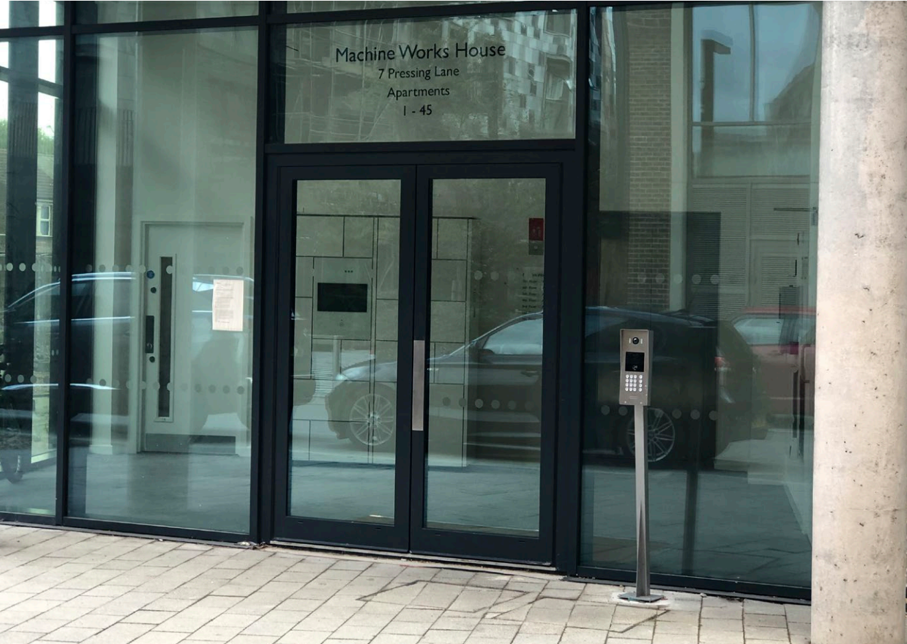
IPVIEW® POSTED MOUNTED for Flats 46–81