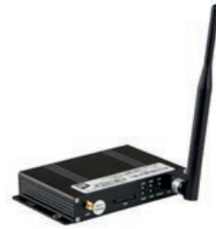
IGSM4G/IP router modem Only required if 4G aerial needs to go on roof, max 80 metres from IPGUARD (usually in top floor riser), ZAN1055 and AR122 PSU included.