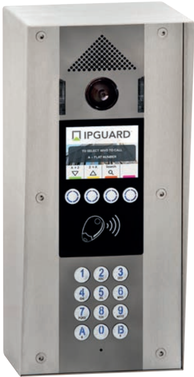
IPGUARD PRO Surface