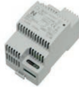
AR122 (12VDC/2A) for locking