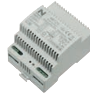
AR125 (12VDC/5A) for IPGUARD